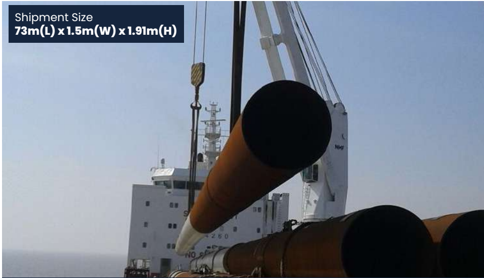
Pipes Transportation GALLE, SRI LANKA TO DAHEJ, GUJARAT, INDIA

Shipment Size 73m(L) x 1.5m(W) x 1.91m(H)