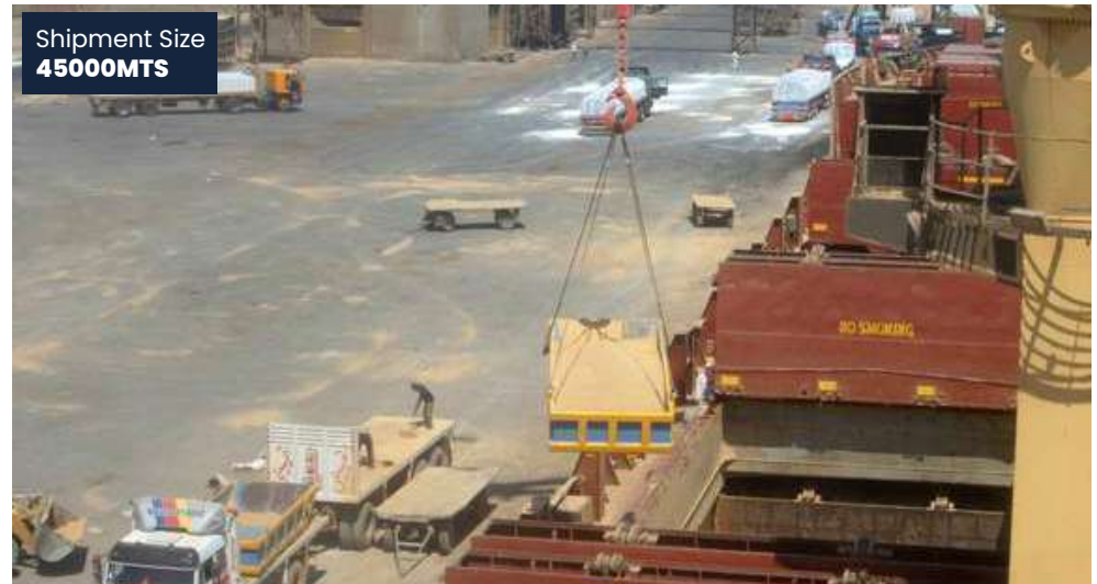
Rock Phosphate Transportation CASABLANCA, MEXICO TO KOREA