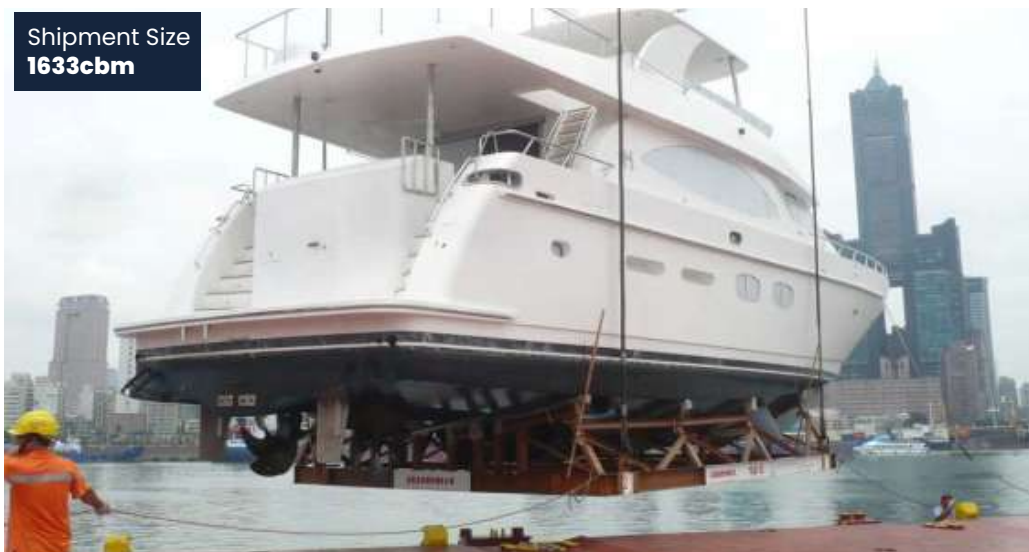
Transportation of Yacht SINGAPORE TO KAOHSIUNG, TAIWAN