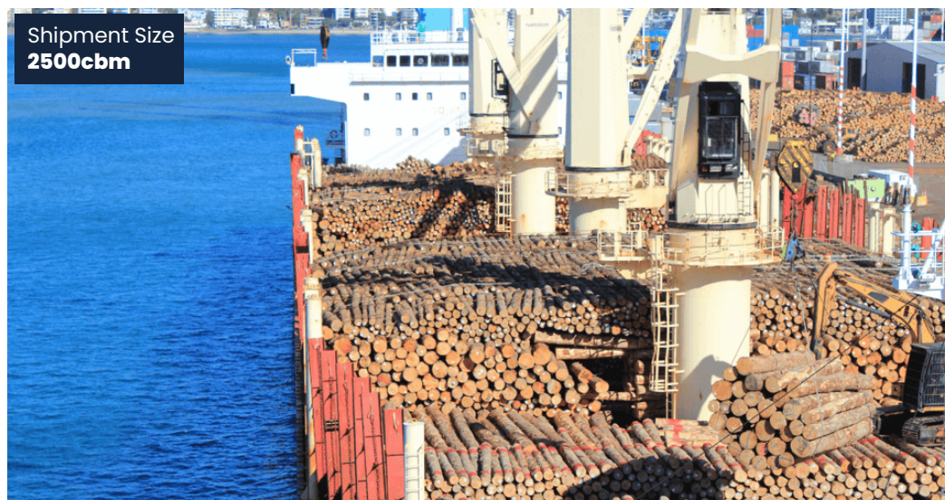
Logs Shipment NEW ZEALAND TO KANDLA PORT, INDIA