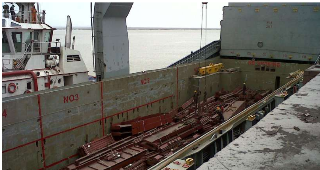
Fabricated Steel Structure Transportation HAZIRA, INDIA TO DULUTH, U.S.A