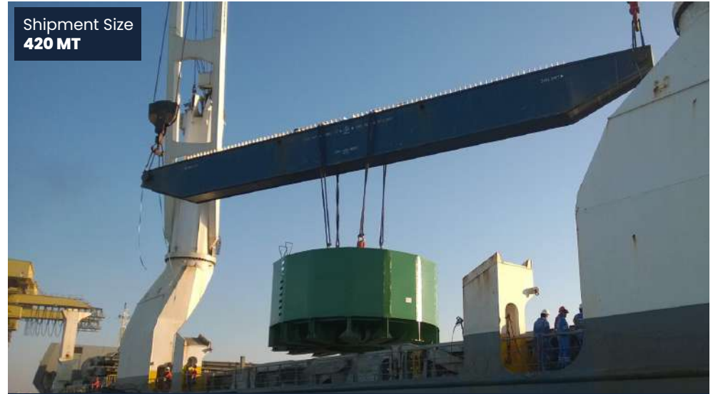
Fibre Optic Submarine Cable ROGNAN, NORWAY TO MINA ZAYED