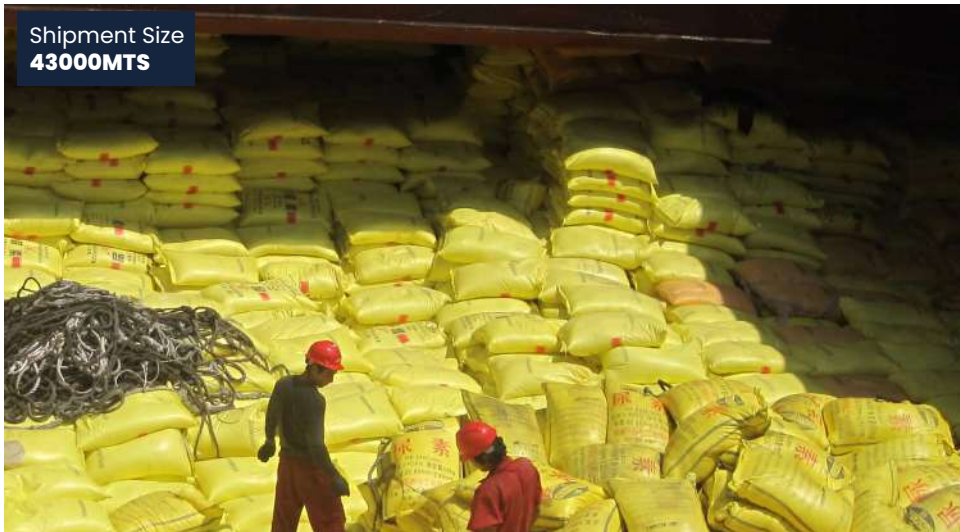
Fertilizer Transportation YANTAI, CHINA TO SRI LANKA