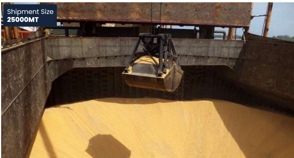
Maize Transportation KAKINADA, INDIA TO INDONESIA